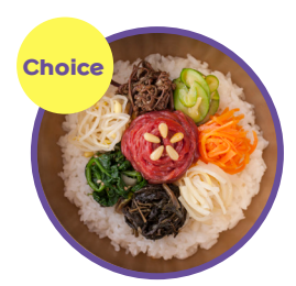
K-Food Cooking Class

Natural ecological park built on trash landfill