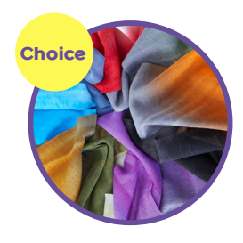
Natural dyeing experience

Making knot accessories with traditional fiber