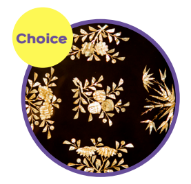
Mother of pearl experience

Dyeing silk or cotton fabrics with natural color material