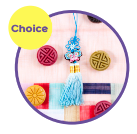
Traditional knot work experience

Chance to learn and taste casual Korean home food